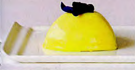
"La Mancha" (yellow cake with saffron, blackberry, honey) at Nadège Patisserie