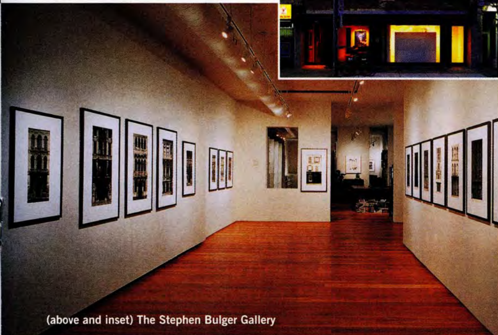
(above and inset) The Stephen Bulger Gallery